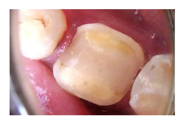
Fig 7- Tooth surface prepared for ceramic overlay