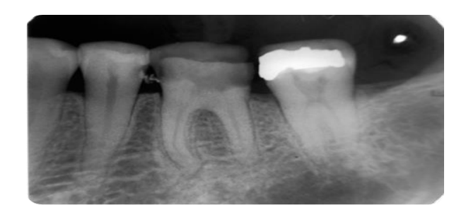
Fig:2-Preoperative radiograph of the tooth